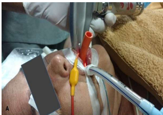
Fig. 1a: Passing of endotracheal tube into the oesophagus.